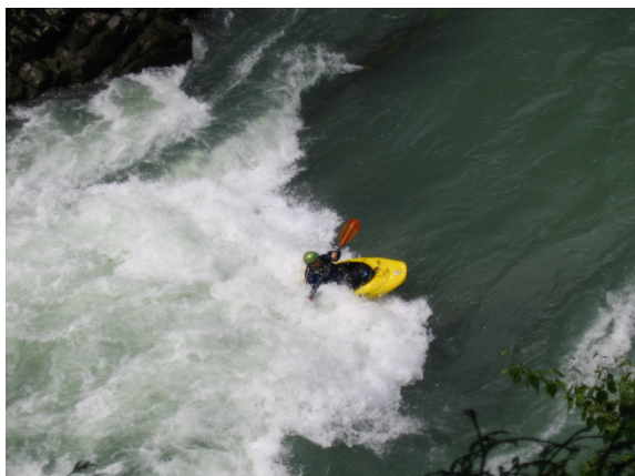
Morgan Baldwin rippin' up 'dog dish' on the Kalum River

Quesnel Paddlefest —May 26 - 28; Willow River Fest —June 17 - 18; Tatlowfest —July 7 - 9; Fraserfest —July 15 - 16; Terrace Paddle Party —Aug 4 - 7; Whitehorse Paddlefest —Aug 11- 13 UnLikeley Paddlefest —Sept 15 - 18